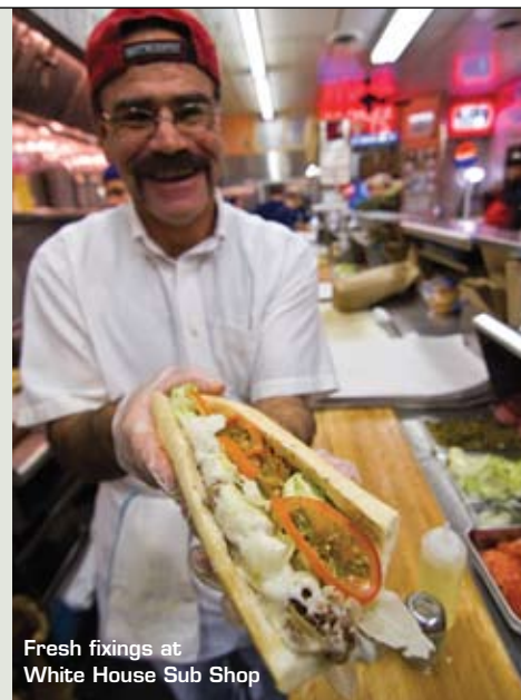
Fresh fixings at White House Sub Shop

Thick-sliced orange and almond French toast and award-winning buttermilk pancakes give the Mad Batter the best