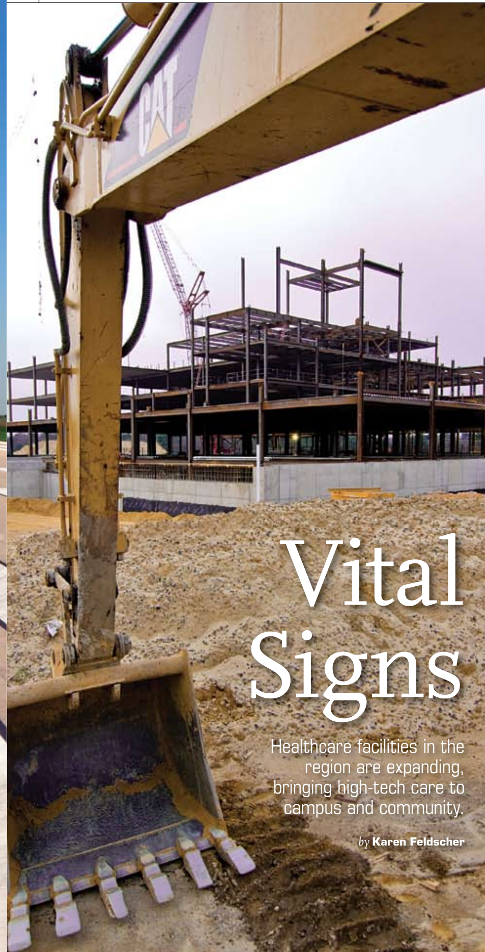
Virtua Health's new campus takes shape in Voorhees.

New, patient-friendly hospital buildings. Emergency room overhauls. New oncology units, outpatient facilities, and wellness centers. Even in this worrisome economic climate, hospitals and health-care systems in southern New Jersey are busy upgrading facilities and improving care.