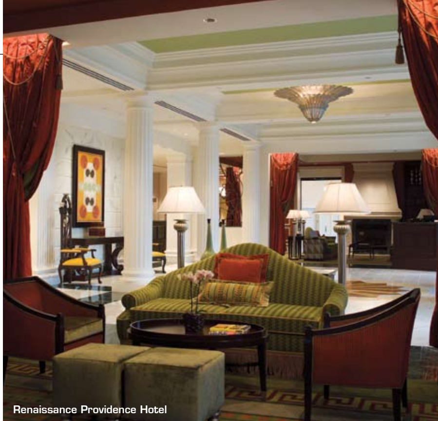
Renaissance Providence Hotel

rious suites. This Rhode Island tradition maintains every bit of glamour and elegance that it had during the Roaring Twenties. The hotel just completed a $14 million renovation to restore its original allure while offering modern-day amenities like a Red Door spa, Starbucks, and McCormick & Schmick's restaurant. 11 Dorrance St., Providence, 401-421-0700, providencebiltmore.com