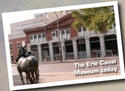
The Erie Canal Museum today